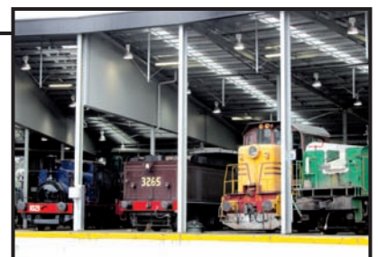
Australia's newest Roundhouse opened in November 2009. Visitors can watch maintenance and conservation work on heritage trains and the drama of the working turntable.