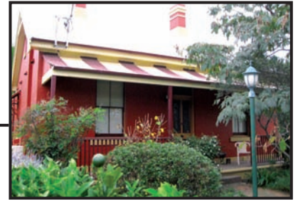
The late 19th century heritage Station Master's House exterior has been restored to its former glory.