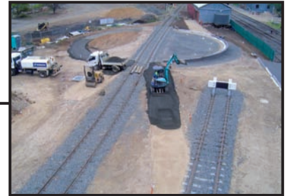
The Amphitheatre (former turntable site) is taking shape.