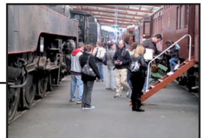
The Display Hall face lift is complete. New skylights and better paths allow visitors to see the amazing range of the State's heritage trains - in a bright new light!