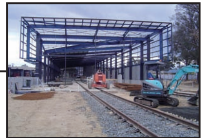
Construction of the new multi-purpose Exhibition Building - providing visitor amenities, retail space, theatre and offices is under way. The foundations alone involved over 50 truckloads of concrete.