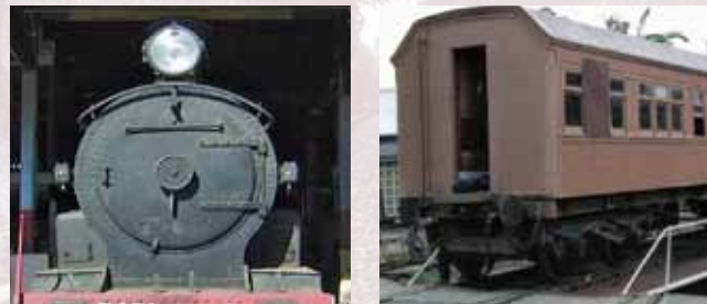
(Above left) Locomotive 5461 – Built in 1916 and operated from the Valley Heights Depot.