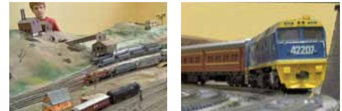
(Above) Our model railway along with an extensive display of railway memorabilia including maps and photographs help to bring the Blue Mountains to life.