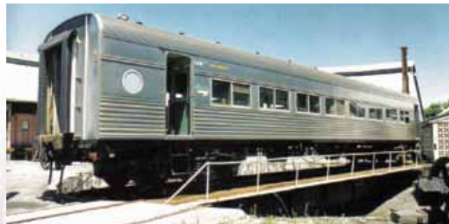
(Above) Stainless Steel Interurban Car - Introduced with electric traction during the late 1950s.

The Museum houses a collection of historic railway and tramway locomotives depicting the development of rail transportation in NSW over a century from the 1880s through to the 1980s.