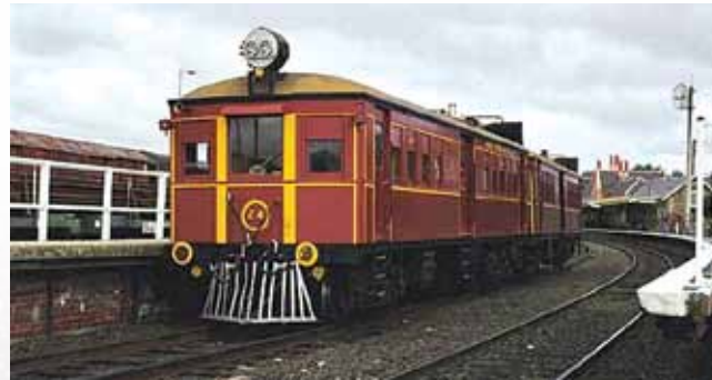
(Above) CPH Railmotor 24 pictured at Bathurst during a charity charter.