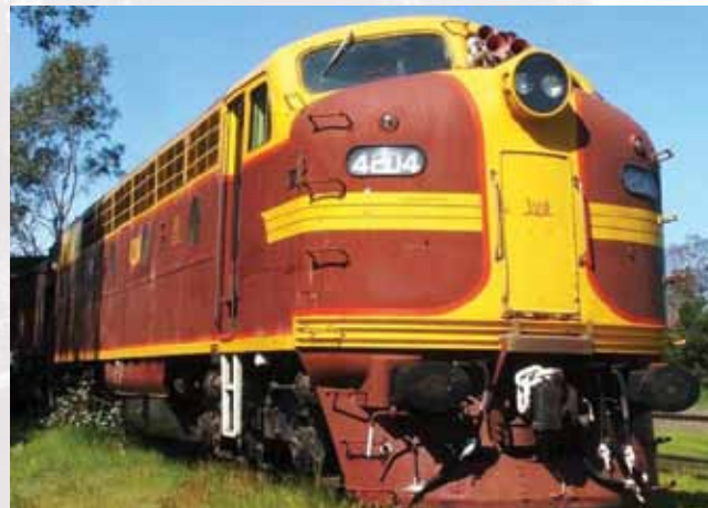
(Above) Diesel locomotives 4204 - a first generation GM main line diesel from the 1950s.