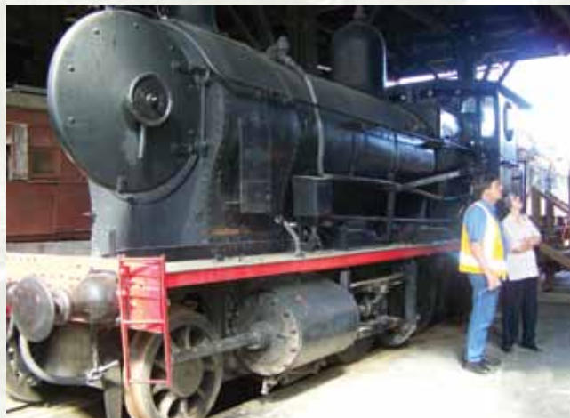
(Above) Historic Loco 2413.