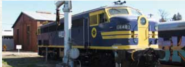
(Above) Historic Loco 4403.

The Junee Roundhouse is one of few surviving, working railway Roundhouses in the Southern Hemisphere displaying steam and diesel locomotives along with a number of other unique heritage items.