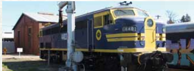
(Above) Historic Loco 4403.

The Junee Roundhouse is one of few surviving, working railway Roundhouses in the Southern Hemisphere displaying steam and diesel locomotives along with a number of other unique heritage items.